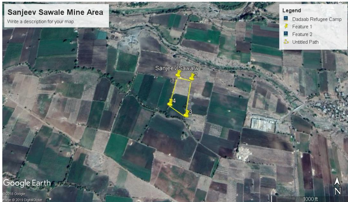
Figure 1: Google image of Proposed Quarry with Crusher